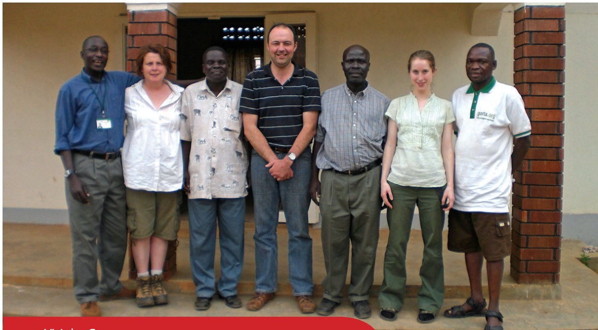
Visit by Gorta team

Gorta supports development projects in India, Kenya, Tanzania, Malawi and Uganda. With respect to Uganda, in the last 2 years attention has been focused on the West Nile region. Why? This article attempts to provide the justification for such a consolidated support to the region.